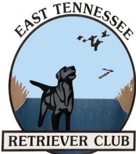
Photo of the Month