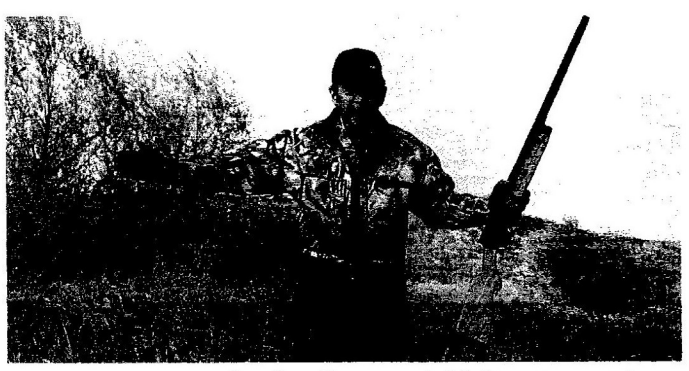
One common error when handling is to hold the gun away from the body with one hand while giving an "over" with the other hand. You can see the confusing picture the dog is now confronted with!

Also, when giving an "over" cast, stepping in the direction of the cast helps the dog see your signal from a distance. Remember, a dog's vision is much like ours when watching a black & white T.V. Some colors that are very easy for us to see are just gray to them. However, dogs are very keen at picking out motion.