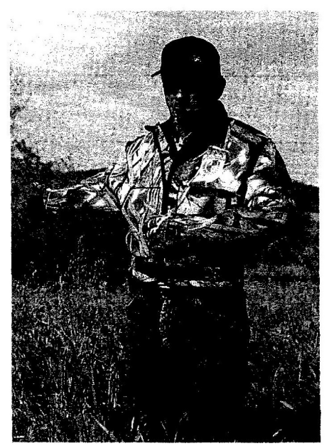
When giving an "over" cast, do not slant your arm behind you as it significantly decreases the visibility of your cast.

to position the arm too far behind the body rather than fully extended straight out from the side. The dog loses sight of your palm if your arm is too far back.